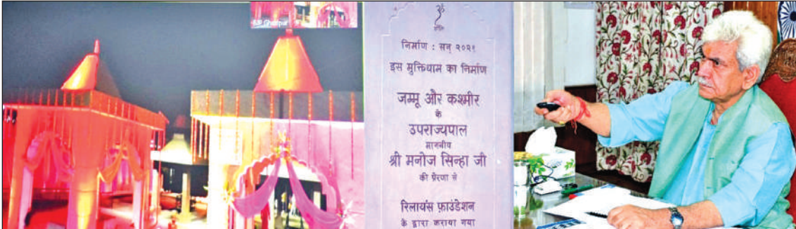
LG Manoj Sinha virtually inaugurating renovated Baikunth Dham situated on the banks of Ganga in Razaganj locality at the eastern end of Ghazipur city.

Lt Governor said that the process of beautification project of Muktidham