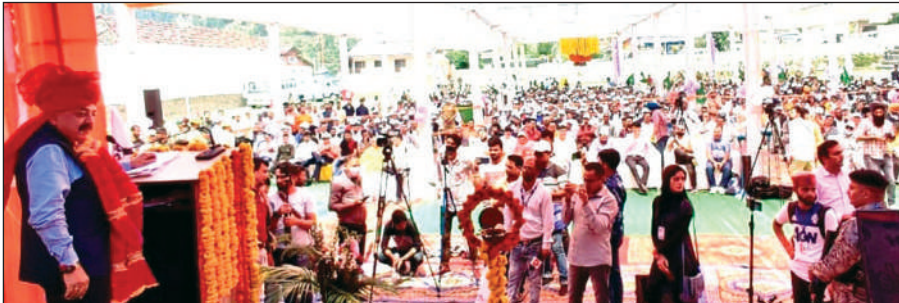
Union Minister Dr Jitendra Singh addressing a public rally after inaugurating the country's first 'Lavender Festival' at Bhadarwah, on Thursday.

Today's Lavender Festival in the valley of Bhaderwah is the best example of develop-