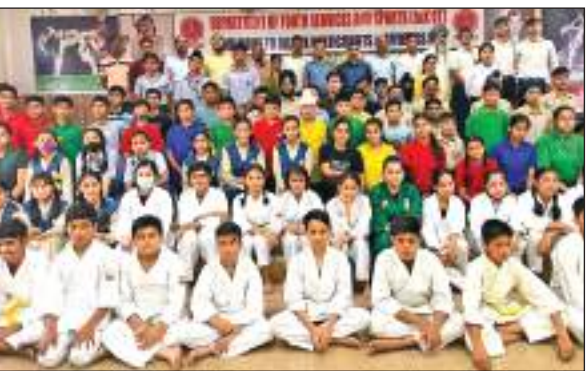
Participants posing for a photograph with dignitaries.