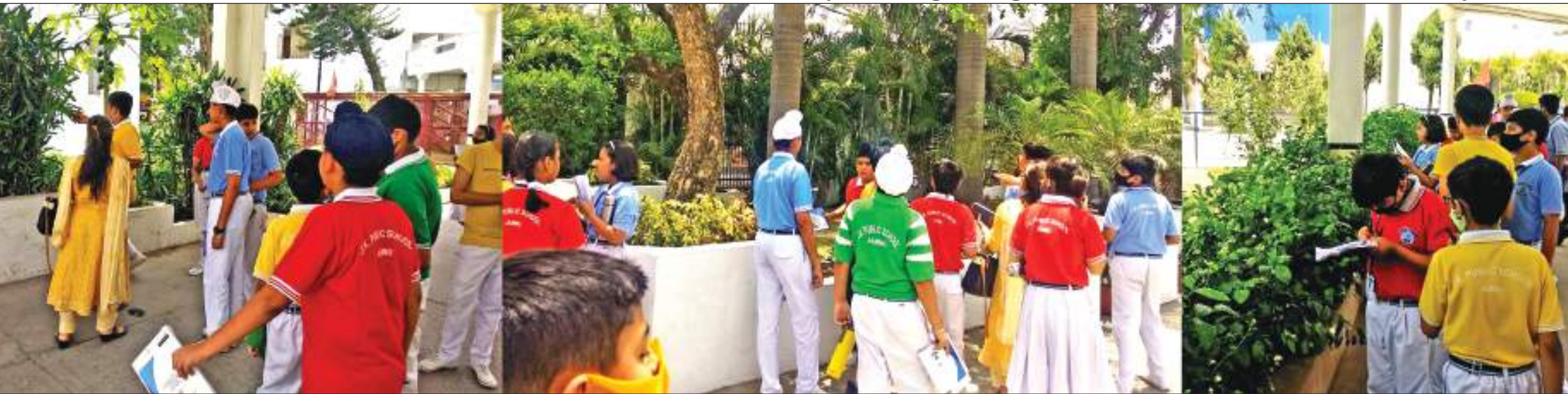
Green Warriors of MS Swaminathan Club busy in designing Flora Book of JKPS Kunjwani with help of teachers.