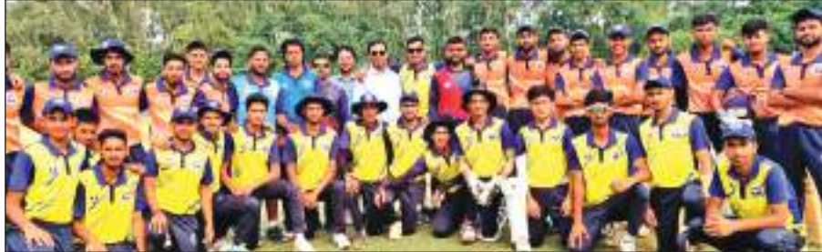
Players posing alongwith Selectors and Officials at GGM Science College Hostel Ground in Jammu.