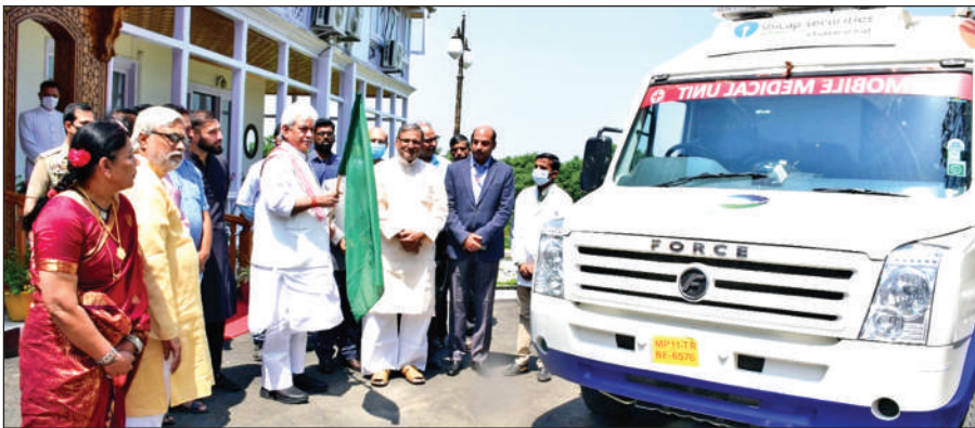
LG Manoj Sinha flagging-off Mobile Medical Units for J&K and Ladakh.