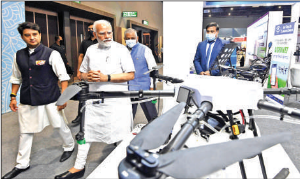
PM Narendra Modi at the Bharat Drone Mahotsav at Pragati Maidan in New Delhi on Friday.

Addressing a gathering after inaugurating India's biggest drone festival in Delhi, he said, "At a time when we are celebrating