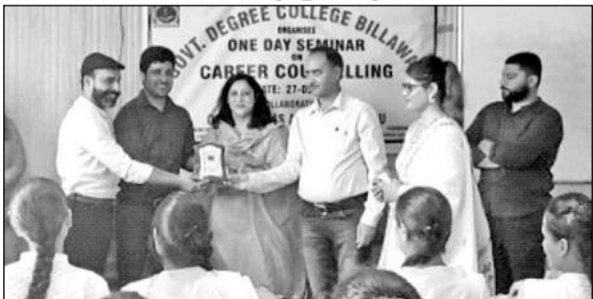
Resource person being honoured during the programme.

■ STATE TIMES NEWS BILLAWAR: Career Counseling Cell, Govt. Degree College Billawar organised a awareness programme on "Career Options for Under-graduate Students".