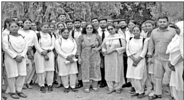
Faculty along with students during visit to Sulla park at Reasi.

■ STATE TIMES NEWS REASI: A tourism tour was organised by Yuva Tourism Club of GGZSMDC Reasi at Sulla Park, Reasi. Sulla Park is one of the important tourists' spots in Reasi district of J&K which is known for its natural beauty. This park is located on the bank of River Anji. This spot is located at Katra-Reasi road and is about 4 Km from Reasi town. About 43 Yuva tourism volunteers of the college participated in the event. The main