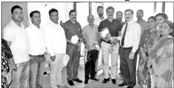
JU's team during visit to GDC Mahanpur.