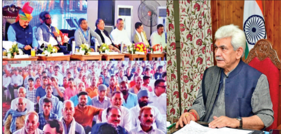
LG Manoj Sinha addressing during inauguration of North India's first-ever Industrial Biotech Park in Kathua on Saturday. Union Minister Dr Jitendra Singh is also seen.

Udhampur Parliamentary constituency, said that the