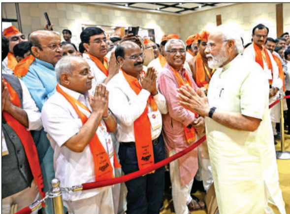
PM Narendra Modi at seminar of leaders of various cooperative institutions on 'Sahkar Se Samruddhi' at Mahatma Mandir, Gandhinagar on Saturday.

With the liquid urea plant, the power of a full sack (50 kg) of urea has come into a half-litre bottle, leading to