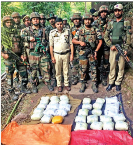
Security personnel along with seized consignment of narcotics along IB in Poonch.

However, no one was arrested in connection with the recovery, the officials said.