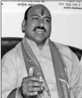
Khalistanis supporters in