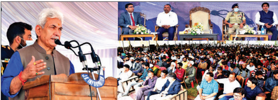
LG Manoj Sinha addressing gathering after inaugurating various projects at Srinagar on Monday.