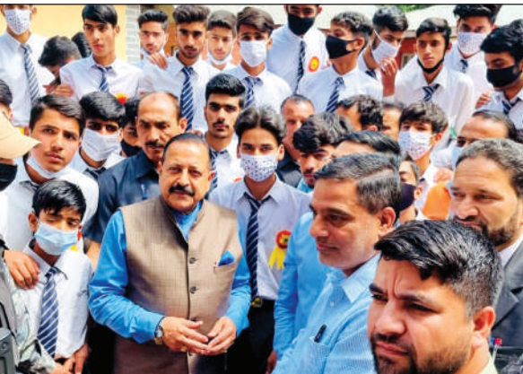
Union Minister Dr Jitendra Singh interacting with children during a visit to Budgam on Monday.