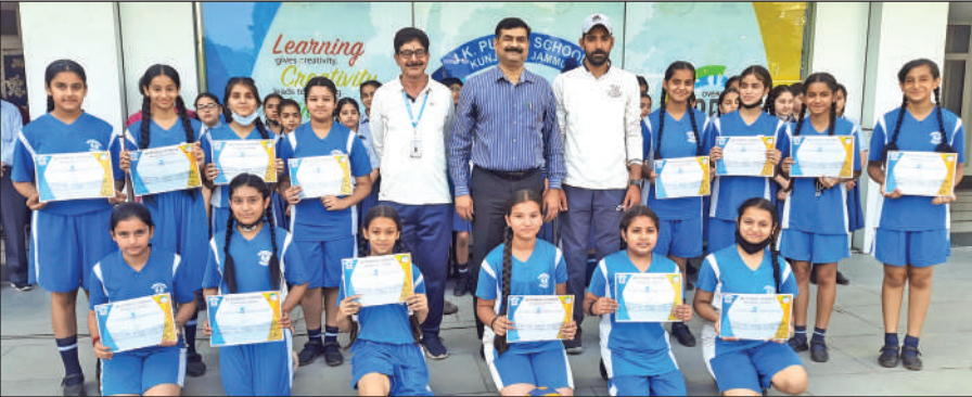
JKPC Kunjwani faculty felicitating winner Volleyball team of the school.