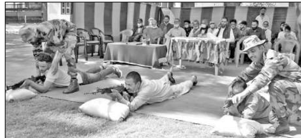
Army personnel imparting training to VDC members.

VDC members appreciated the support provided by Indian Army in improving