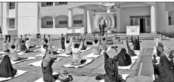
Participants performing Yoga Aasan.