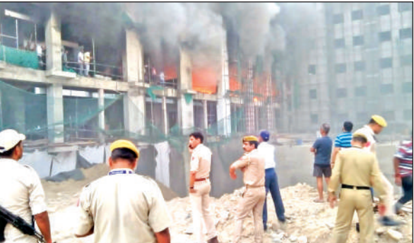
Police visiting AIIMS at Vijaypur to check fire incident.

■ STATE TIMES NEWS JAMMU: A minor fire broke out on the first floor of under-construction building