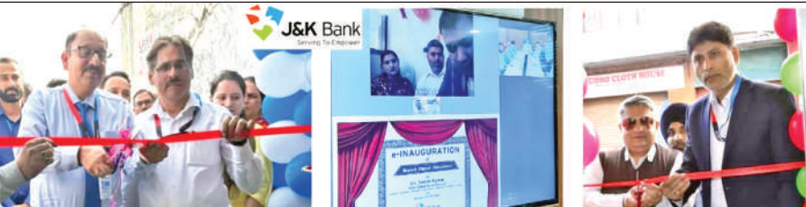
J&K Bank officers inaugurating ATMs on Sunday.