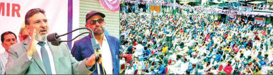
Apni Party President Syed Mohammed Altaf Bukhari addressing gathering at Poonch.