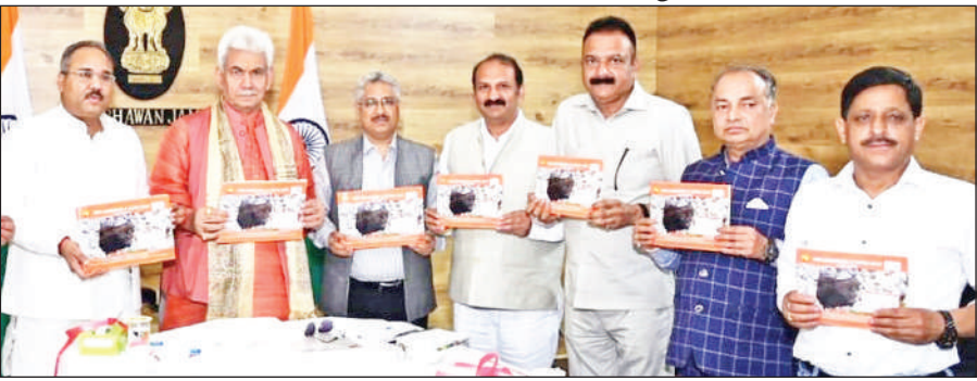
Lt Governor Manoj Sinha and others releasing "Shri Amarnathji Yatra Guide book".

■ STATE TIMES NEWS JAMMU: Lieutenant Governor Manoj Sinha released "Shri Amarnathji Yatra Guide book" published by Tourism Federation of Jammu, on Sunday. The Lt Governor appreciated the Tourism Federation of Jammu for selfless service to pilgrims. The Lt Governor also shared the key initiatives taken by the UT Government and Amarnathji Shrine Board to facilitate the hassle-free and smooth pilgrimage of the devotees.