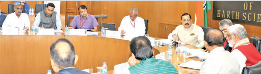
Union Minister Dr Jitendra Singh chairing the high-level Inter-Ministerial Steering Committee meeting of "Deep Ocean Mission" at Prithvi Bhawan, New Delhi on Wednesday.