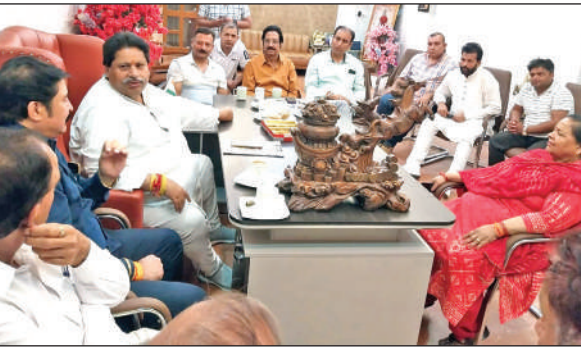
JKPCC Working President Raman Bhalla chairing a meeting.

online system, he added. Although offline ticketing is still operational, but it is limited to just 400 reservations. Some guides were compelled to engage in black-marketing of tickets, despite fact that they do not support such acts. Guides claimed that the issue has been discussed with the higher authorities but no action has been taken yet in this regard.