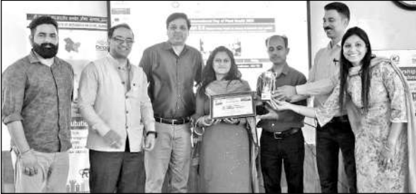
Dignitaries during the event.