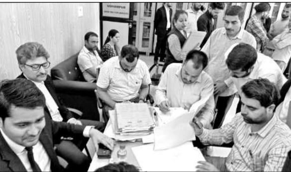
A bench taking up cases in Udhampur.