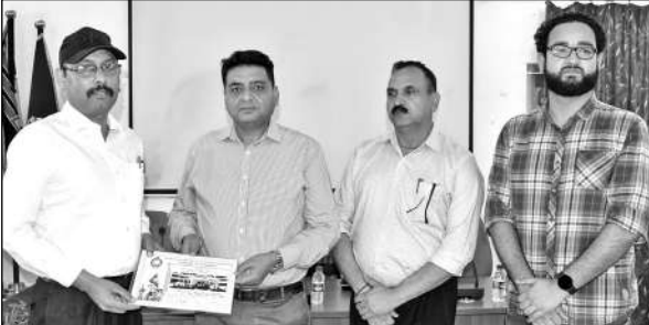
A participant receiving certificate.

UDHAMPUR : Five-days course on "Investigation of Traffic Accident Cases" and 05 days training programme on Cyber Forensic culminated at SKPA. (27) Officers of different wings/units of J&K Police participated in the training programme. The courses have been designed to meet the desired objectives like Type and definition of Road Accident, Causes and consequences of road traffic crashes, Traffic Control devices, Road signs, Road markings, Speed breakers, Traffic signals, etc. helping aids for traffic management, Legislation related to traffic accidents, Understanding Road Traffic violations, Basics of traffic engineering, First Aid - Importance golden hour, transport and First Aid to victims of road accidents. To meet the desired objectives eminent guest faculty from differ-