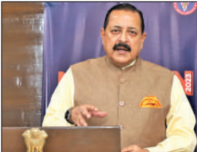
Union Minister Dr Jitendra Singh delivering keynote address at the 42nd Annual Conference of "National Medicos Organisation" (NMO) at AIIMS Kalyani, near Kolkata on Saturday.

Talking about the 2-day Medical Conference happening near Kolkata, the Minister said that Kolkata has been a seat of medical academics since pre-independence times. Kolkata was the place where India's first Medical College was set up in 1835. The second Medical College was established in Chennai. India's first University, The University of Calcutta was also set up in