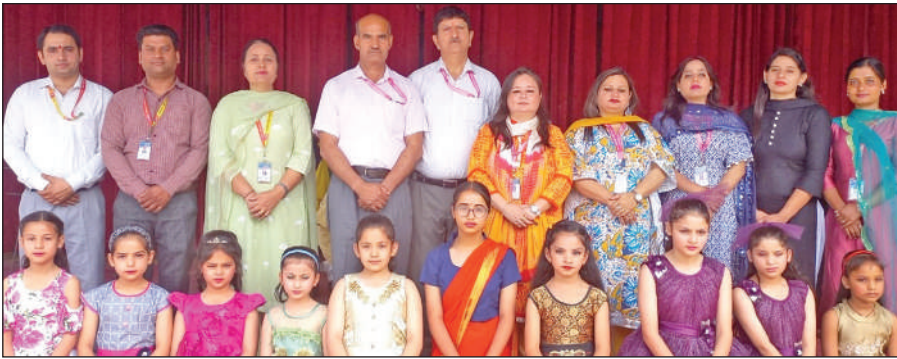
HPS faculty and students during Mother's Day celebration.