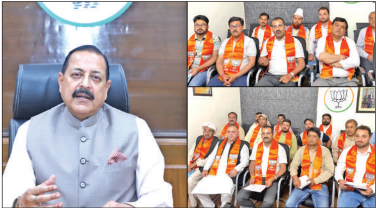
Union Minister Dr Jitendra Singh holding online feedback session with party office bearers of BJP from district Doda of his Lok Sabha constituency, on Sunday.

Minister provided them with an update about some of the latest information regarding the constituency and the new development works approved recently.