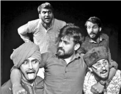
Natrang artists performing in a play.