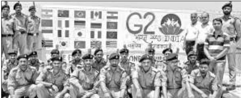
Faculty along with NCC unit of college during the programme.