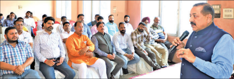
Union Minister Dr Jitendra Singh addressing BJP party workers during Mandal and Booth level campaigning for upcoming Lok Sabha byelection at Jalandhar on Wednesday.