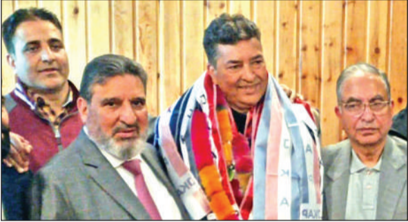
JKAP Chief S.M.A Bukhari welcoming newly joined member.