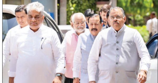
Delegation of senior BJP leaders led by Union Ministers Bhupendra Yadav, Dr Jitendra Singh and BJP National General Secretary Tarun Chugh after meeting ECI at New Delhi.

A delegation of senior BJP leaders led by Union Ministers Bhupendra Yadav, Dr Jitendra Singh and BJP national general secretary Tarun Chugh called on the chief election commissioner and presented him a memorandum demanding immedi-