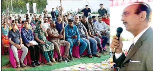
DPAP Chairman Ghulam Nabi Azad addressing Kashmiri Pandits and party workers at Jagti Township.

Azad said this while addressing the Kashmiri migrant Pandits community members and party workers at Jagti Township, here on