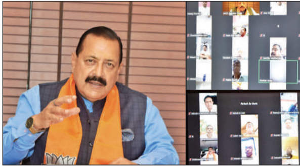
Union Minister Dr. Jitendra Singh convening a joint meeting of the West Bengal Lok Sabha constituencies going to poll in Phase 5, at Kolkata on Tuesday.

He said, since he had just landed in Kolkata and not given an advance notice of a meeting, therefore instead of disturbing the Karyakartas during their respective field work, it was decided to conduct