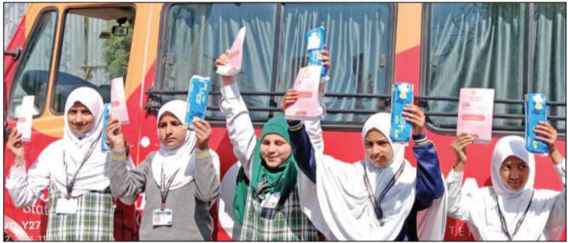
Ujaas Menstrual Health Express reaches J&K on Tuesday.

During the campaign's first phase, the Ujaas team conducted age-appropriate