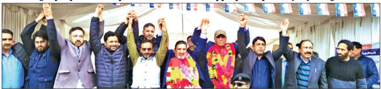
President of Apni Party, Syed Mohammad Altaf Bukhari with party workers at a public meeting.

Urges people to show political families their appropriate place by rejecting them through power of vote