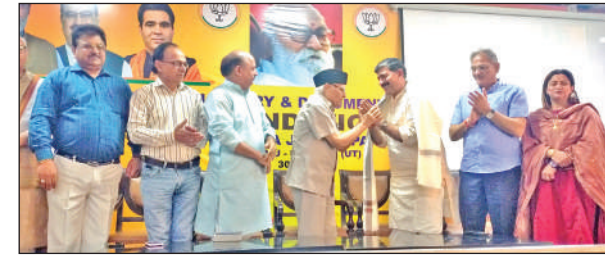
BJP leaders celebrating Foundation Day of the Nanaji Deshmukh Library and Documentation Department.

STATE TIMES NEWS JAMMU: 7th Foundation Day of the Nanaji Deshmukh Library and Documentation Department celebrated by the Jammu and Kashmir BJP at their headquarters in Trikuta Nagar, Jammu.