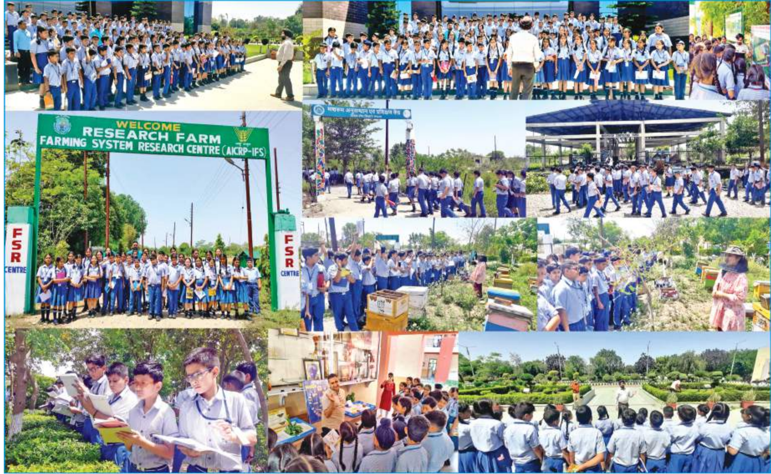
JK Public School Kunjwani students and faculty members at a transformative educational visit to the Sher-e-Kashmir University of Agriculture Sciences and Technology (SKUAST), Jammu, on Tuesday.