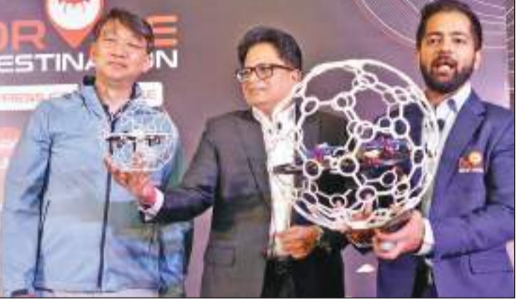
ing World Cup.

In India, the Drone Soccer Association India (DSAI) emerges as a pivotal founding member of FIDA. Endowed with exclusive rights to govern and organize drone soccer activities within the nation, DSAI shoulders the responsibility of orchestrating national and international leagues, tournaments, and selecting and sending the Indian team to compete in the upcoming