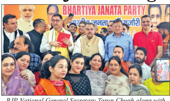
BJP National General Secretary Tarun Chugh along with party workers during a programme at Rajouri.

■ STATE TIMES NEWS RAJOURI: BJP National General Secretary Tarun Chugh on Saturday said that the Prime Minister Narendra Modi's government has won the hearts of people in Jammu and Kashmir following the policy of 'Sabka Vikas, Sabka Vishvas'. Addressing a meeting of party workers in Rajouri, Chugh said there was a deliberate design by the Abdullahs and Muftis to breach the trust of the people in Jammu and Kashmir and across the country. Their intention has always been to create a sense of insecurity