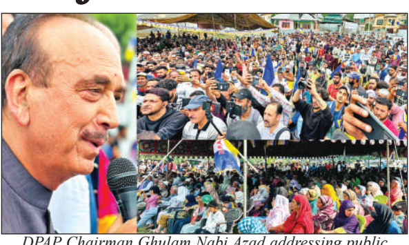
DPAP Chairman Ghulam Nabi Azad addressing public meeting at Ganderbal on Saturday.

■ STATE TIMES NEWS SRINAGAR: Chairman Democratic Progressive Azad Party (DPAP), Ghulam Nabi Azad on Saturday vehemently denounced National Conference leaders, asserting his commitment to serving the people without seeking favors from any quarters. Addressing public meetings at Brein, Nishat and Ganderbal, he emphasized his commitment to the welfare of the people, devoid of exploiting them for electoral gains. Referring to accusations of affiliation with BJP,