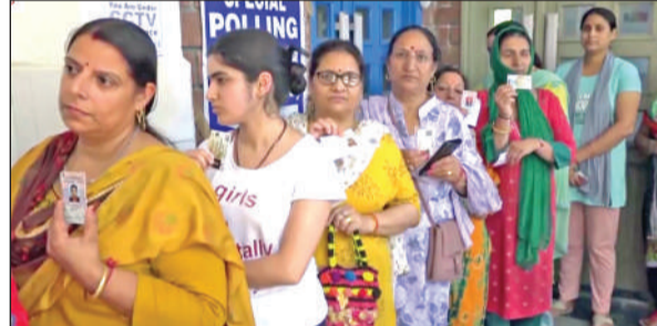
Displaced KPs waiting for their turn to cast votes at Jagti in Jammu on Monday.

STATE TIMES NEWS JAGTI: Despite a hot weather; Kashmiri Pandits from the Srinagar constituency flocked to special polling stations in Jammu on Monday and voted for the rehabilitation of their community on "social, economic, and political" fronts. The community which was forced to flee from the valley in the early 90s under fear of militancy demanded their permanent return and rehabilitation with guarantee of peace and security. Kashmiri Pandits lined up in long queues amid tight security to cast their ballots in the fourth phase of the Lok Sabha