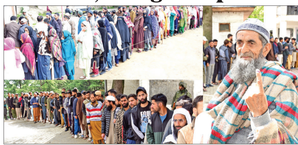
Phase-IV of Lok Sabha Elections: Glimpses of polling for Srinagar PC at several polling stations on Monday.

in the constituency. Assembly segment wise highest poll percentage was observed in Kangan with 58.80 per cent while Habbakadal registered lowest polling of 14.05 per cent. The gross voter turnout recorded in past few elections in the Srinagar PC, as given by the CEO office, was 14.43 per cent in 2019, 25.86 per cent in 2019, 25.55 per cent in 2009, 18.57 per cent in 2004, 11.93 per cent in 1999, 30.06 per cent in 1998, 40.94 per cent in 1996, no election was held in 1991 due to turmoil and 1989 remained uncontested. At the time of culmination of polling, Assembly Segment wise tentative voter turnout in 2-Srinagar PC was Kangan 58.80 per cent, Ganderbal 49.48 per cent, Hazarathal 28.28 per cent, Khanyar 24.24 per cent, Habbakadal 14.05 per cent, Lal Chowk 27.33 per cent, Channapora 22.97 per cent, Zadibal 29.41 per cent, Eidgah 26.81 per cent, Central Shalteng 26.43 per cent, Khansahib 50.35 per