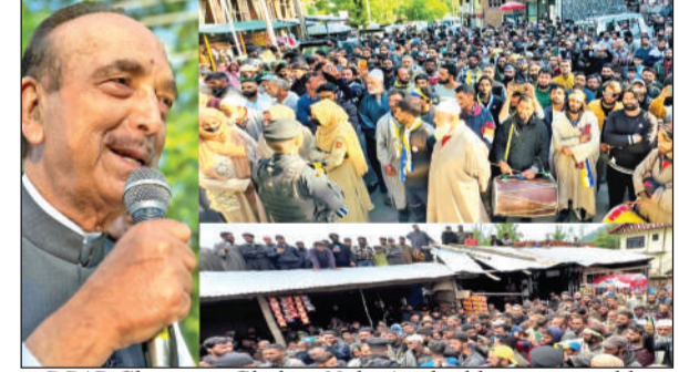
DPAP Chairman Ghulam Nabi Azad addressing a public meeting at Pahalgam on Monday.

STATE TIMES NEWS SRINAGAR: Chairman Democratic Progressive Azad Party (DPAP), Ghulam Nabi Azad, on Monday called out both, the National Conference and the Peoples Democratic Party as products of the Bharatiya Janata Party. Addressing a public meeting at Pahalgam, he reminded the NC and the PDP about their histories of forming governments in coalition with the BJP and questioned their commitment to genuine development. Azad emphasized the lack of tangible progress under