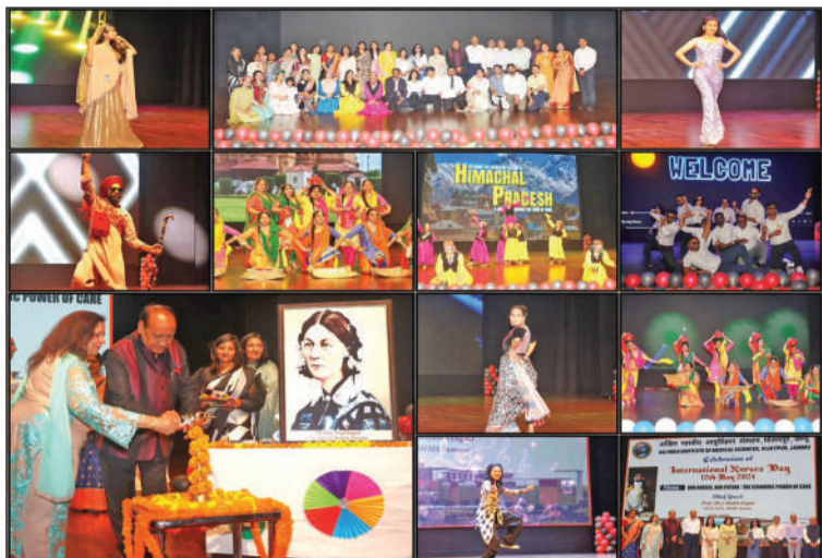
Glimpses of International Nurses Day celebration at AIIMS Jammu.

STATE TIMES NEWS JAMMU: International Nurses Day is a momentous occasion celebrated worldwide to honor the remarkable contributions of nurses to society. Nurses are the backbone of healthcare systems globally, serving on the frontlines of patient care, research, education, and advocacy. Their unwavering commitment and compassion empower individuals and communities, driving positive health outcomes and fostering resilience, especially in times of crisis. As the world faces unprecedented challenges in healthcare, today, on International Nurses Day, AIIMS Jammu honours the unwavering dedication and contributions of nurses worldwide.