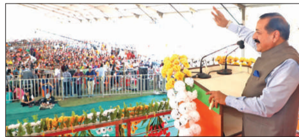
Union Minister Dr. Jitendra Singh addressing a massive public rally in Bongaon Lok Sabha constituency near Kolkata on Tuesday.

STATE TIMES NEWS KOLKATA: Union Minister Dr. Jitendra Singh said here on Tuesday that Modi's "Viksit Bharat" will shape the future of "Viksit Bengal" and that the people of West Bengal are keen to be a part of the mainstream development journey of India led by Prime Minister Narendra Modi. Addressing a massive public rally in Bongaon Lok Sabha constituency close to the Bangladesh border, Dr. Jitendra said, the common masses of West Bengal had made up their mind to defy all the terror tactics of Mamata Banerjee-led TMC and go with Prime Minister Modi. The people are now very clear in their resolve that they no longer want to deprive themselves of the fast-track development happening in every sector across the country and want to be an equal beneficiary of Modi's "Viksit Bharat Yatra", he said.