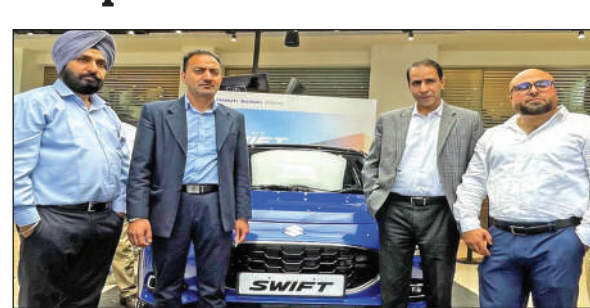
Dignitaries at Jamkash Vehicleades (Kashmir) Pvt Ltd, Srinagar unveiling Epic New Swift.

The sporty design of the Epic New Swift instils a sense of excitement, featuring a unique 'wrap around