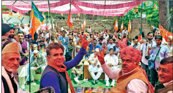
BJP National General Secretary Tarun Chugh along with BJP J&K Chief Ravinder Raina during public meeting.

"These families, who ruled the region for an extended period, were deeply involved in corruption, depleting the state's treasury for personal gain while fostering an environment of terrorism", he added.