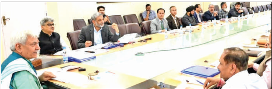
LG Manoj Sinha reviewing progress of schemes & projects of Jal Shakti Department.

Access to safe, adequate drinking water to every citizen my commitment: LG 'Effective action being taken to ensure water security in J&K'