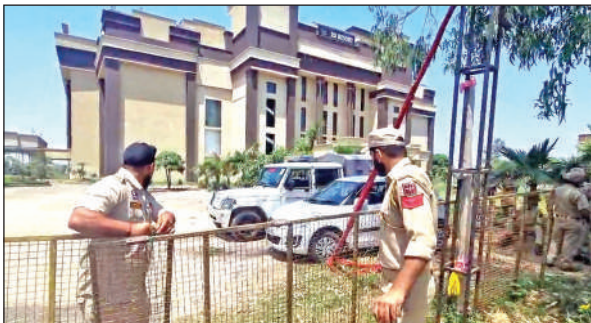
Police team raiding RK Resort at Bhagwati Nagar.