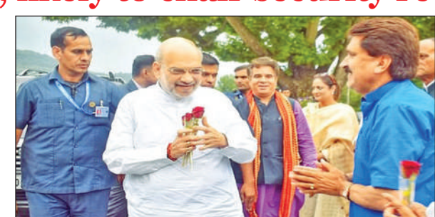
Union Home Minister Amit Shah welcomed by J&K BJI leaders on his arrival.

"We have come to meet the home minister to express our gratitude because after 50 years of struggle, we have finally obtained Scheduled Tribe status. They have fulfilled our demand, unlike other parties who only seek votes but never fulfill their promises. We will remain