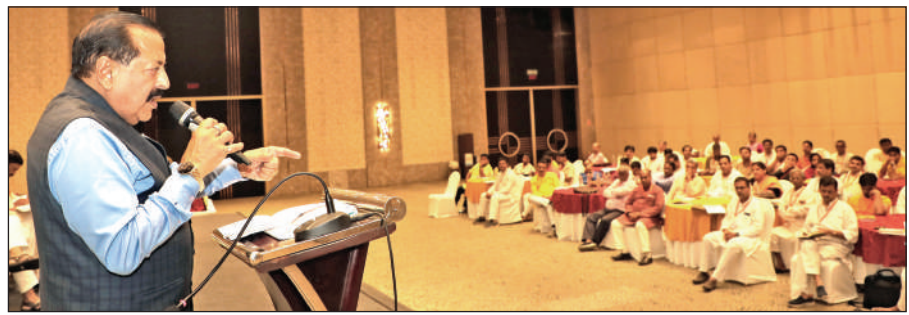
Union Minister Dr. Jitendra Singh addressing joint meeting of 5th phase Lok Sabha constituencies at Kolkata.

STATE TIMES NEWS KOLKATA: Union Minister Dr. Jitendra Singh said here on Thursday that the opposition, particularly the Mamata Banerjee-led TMC, is manufacturing false narrative about the Citizenship Amendment Act (CAA) and called upon the BJP Karyakartas, particularly in the State of West Bengal, to vociferously and consistently refute this false propaganda, which is an attempt by the TMC to mislead the innocent voters at a time when the election process is going on and the 5th phase polling is just three days away. Dr. Jitendra was addressing a joint meeting of the Election Core groups of all the West Bengal Lok Sabha constituencies going to polls in the 5th phase on the 20th of this month. Also present in the meeting were National General Secretary Sunil Bansal, West Bengal State BJP President Dr. Sukanta Majumdar, State