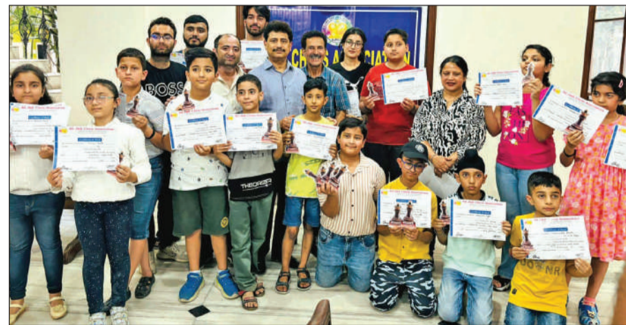
Winner players posing for a photograph with officials and organizers.