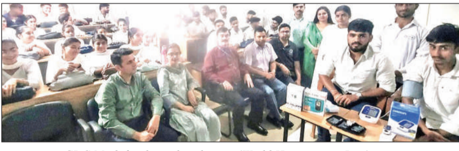
GDC Marh faculty and students at 'World Hypertension Day' camp.

STATE TIMES NEWS JAMMU: NSS Unit of Govt. Degree College Marh organised a two-day camp on 'World Hypertension Day' aimed at communicating the importance of ill effects of Hypertension and to provide information on prevention, detection and treatment.