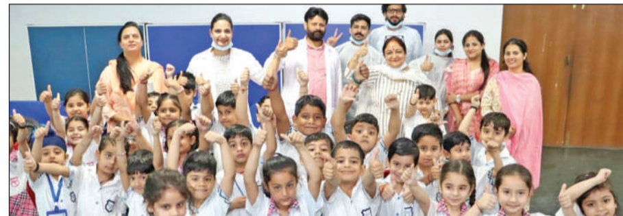
Doctors with students and faculty members of Heritage School.

STATE TIMES NEWS JAMMU: Gummy Bears' World (Kindergarten) of Heritage School organised a dental checkup camp on for all its students as part of 'Health and Wellness week'. The aim of this camp was to check, regulate and maintain the dental wellness of the students and spread