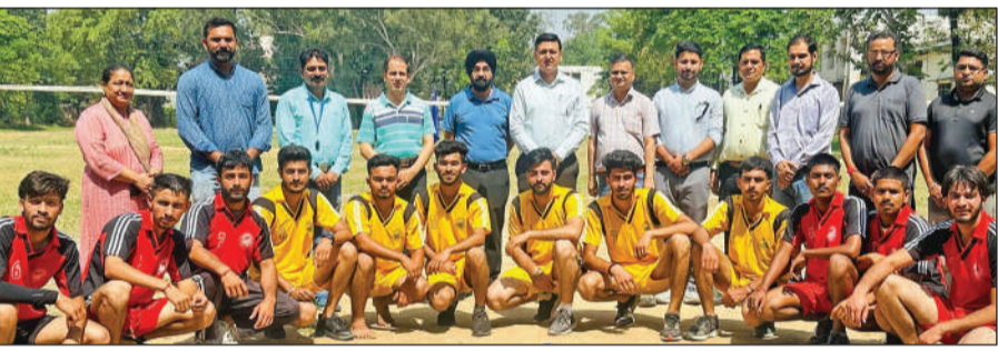
Participating teams posing for a photograph with faculty members.