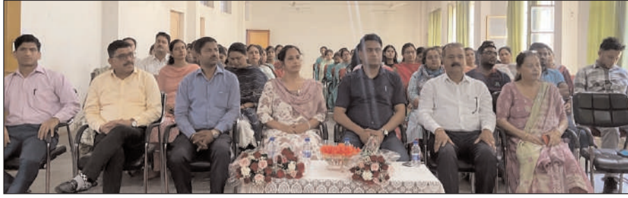
College faculty along with IGNOU officials during the programme.

The initiative aimed to provide students with essential information about the Indira Gandhi National Open University (IGNOU), including its various courses, admission procedures, and the range of student support services available. The program commenced