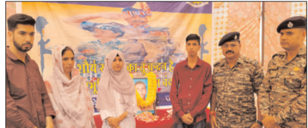
Family members along with CRPF officials during the programme.