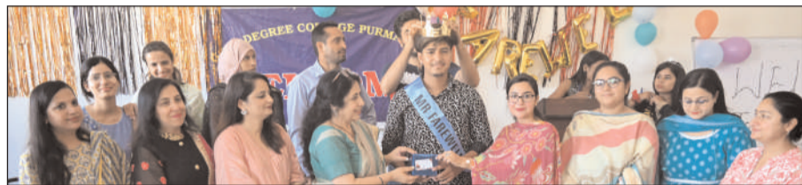
Faculty members and students during the farewell programme.

STATE TIMES NEWS PURMANDAL: Students of Govt. Degree College (GDC) Purmandal organized farewell party for the 6th semester students on Friday.