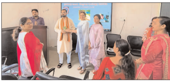
Faculty members honouring a dignitary.