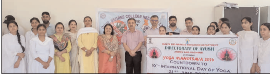
College faculty members and students during the event.