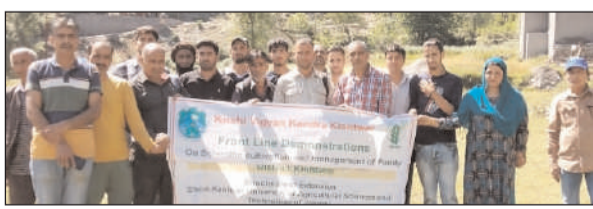
KVK officials along with farmers during the programme.

STATE TIMES NEWS KISHTWAR: Krishi Vigyan Kendra (KVK) Kishtwar SKUAST Jammu on Friday organized one day training programme on scientific cultivation of Paddy at Pehalkala Sigli which was attended by 24 farmers of the village. The pro-