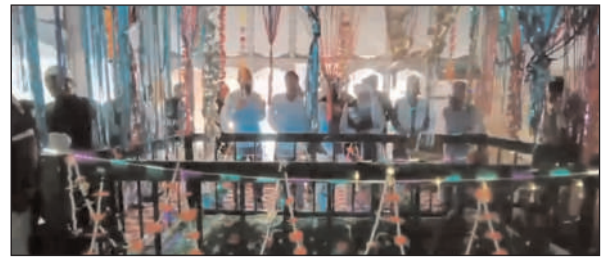
Devotees paying obeisance at Ziarat.

More than 50,000 devotees participated in the event,