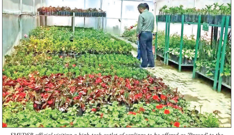
SMVDSB official visiting a high-tech outlet of saplings to be offered as 'Prasad' to the devotees at Katra

These plant sapling in the form of Prasad will also acts as a blessing of the Goddess and is a keepsake of the holy