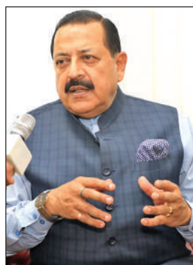
Union Minister Dr. Jitendra Singh speaking to media on Sunday, on the eve of 5th phase polling.

STATE TIMES NEWS NEW DELHI: Union Minister Dr Jitendra Singh said here on Sunday that 5th phase polling tomorrow will reaffirm "lotus" blooming in the East while India's most important Eastern State of West Bengal is all set to maintain the high voter turnout record of the previous four phases. Speaking to media on the eve of the 5th phase polling to seven Lok Sabha constituencies of West Bengal of which he was assigned In-Charge, Dr Jitendra Singh said, in the ongoing election process, in each of the four phases so far, among all the States and Union Territories