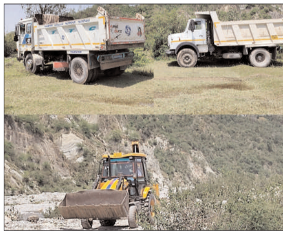
Seized vehicles by Reasi Administration.

STATE TIMES NEWS REASI: Mining Department Reasi, in collaboration with the Police department, executed a comprehensive day-long operation to combat illegal mining activities in the district. The strategic initiative was spearheaded under the vigilant supervision of District Magistrate Reasi, Vishesh Mahajan. During the operation, conducted with meticulous precision, authorities apprehended and seized one heavy excavator along with five dumpers. The vehicles were found to be clandestinely engaged in