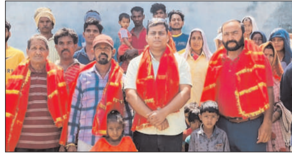
NGO members and others during the programme.