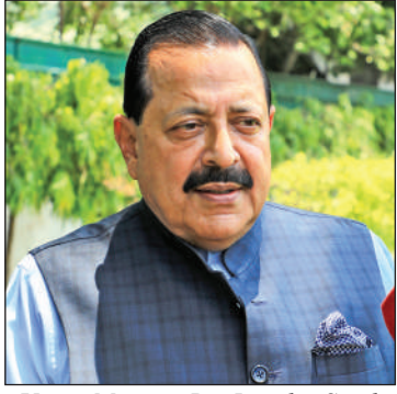
Union Minister Dr. Jitendra Singh in an exclusive conversation with national TV channel NDTV on Monday.

In an exclusive conversation with national TV channel NDTV in which Dr. Jitendra Singh discussed various aspects of ongoing general elections, particularly in Jammu & Kashmir and West Bengal where he was assigned Phase 5 constituencies, Dr. Jitendra Singh said, nothing augurs better for a healthy democracy than to see progressively rising voter turnout in the Kashmir valley constituencies where the polling has been held so far in phase 4 and phase 5 respectively. He said, it is a remarkable departure from the times when the people of the valley were constrained to elect their representatives for Lok Sabha and State Assembly with a voter turnout of hardly 10% or even lesser than that.