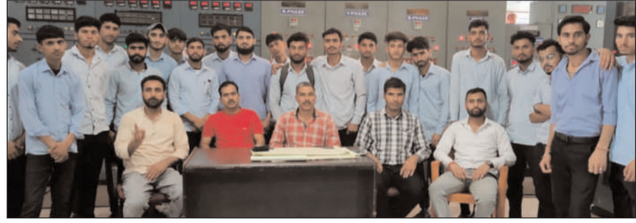
GPC students posing for a photograph with faculty members.