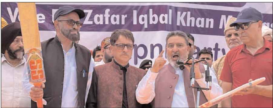
Apni Party President, Syed Mohammed Altaf Bukhari addressing a rally.

He stated that with the creation of this Rajouri - Anantnag Parliamentary constituency, the people from two regions (Jammu & Kashmir) would come closer