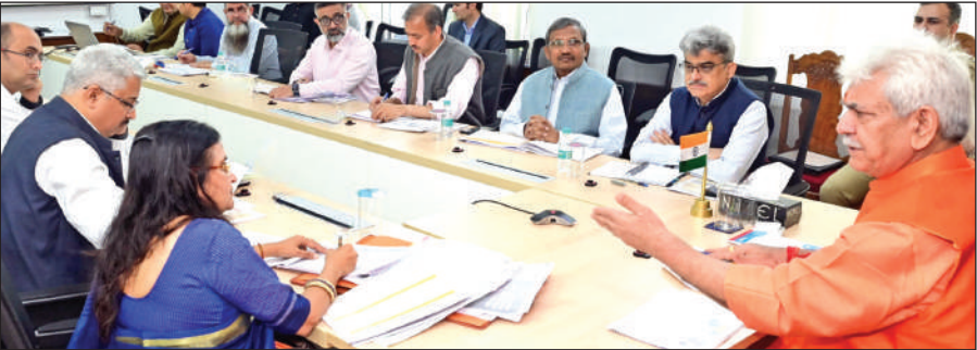
LG Manoj Sinha chairing a review meeting of Hospitality and Protocol Department at Srinagar.