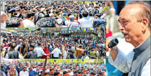
DPAP Chairman Ghulam Nabi Azad addressing a gathering after road show in Kokernag on Tuesday.

■ STATE TIMES NEWS SRINAGAR: Chairman Democratic Progressive Azad Party (DPAP), Ghulam Nabi Azad on Tuesday reaffirmed his unwavering commitment to uplifting the poor and developing underprivileged areas. In a vibrant road show held in Kokernag, Azad highlighted the persistent issues plaguing the region, emphasising that many people still lack access to basic necessities such as electricity and road connectivity. Drawing from his extensive experience as Chief Minister, he assured the audience of