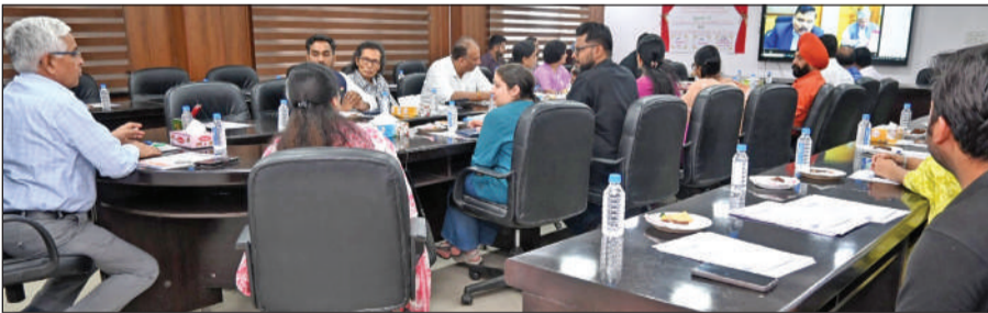
Prpl Secy Higher Education Department, Alok Kumar chairing a meeting.

He emphasized the necessity of access and equity to achieve the goals of blended learning as outlined in NEP 2020. Alok Kumar advocated for a balanced approach, with 40 per cent of content delivered through blended methods focusing on instructions, while the remaining 60 per cent should involve experiential learning methods like problem-solving, project work, and field visits. He also recommended adopting the flipped classroom