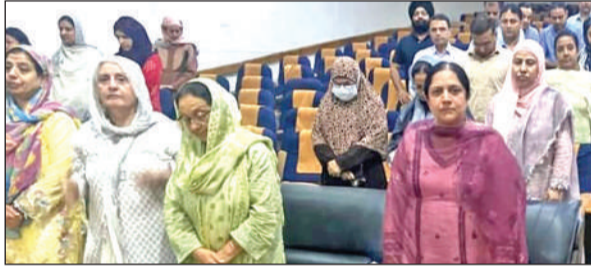
Officials observing silence to mourn the demise.