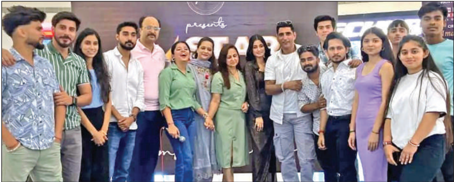
Participants of Star Kid India Jammu audition with officials.