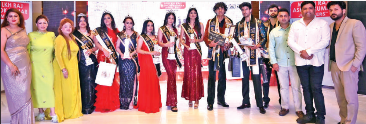
Winners of various titles posing for a photograph with organizers and jury members.