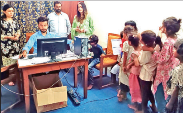
Inmates of Shelter Home participating in Aadhaar enrollment camp.