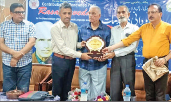
JU faculty honouring a dignitary.