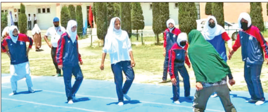
Girls participating in self-defence Training Camp.

The training sessions will continue tomorrow at the same venue, ensuring ample