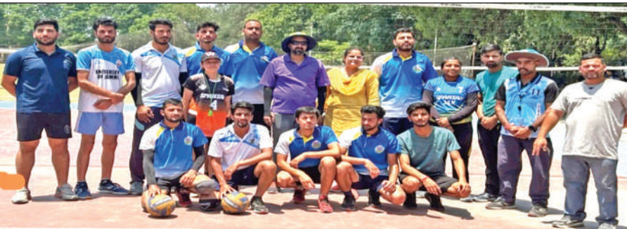
Winner team posing for a photograph with officials at University of Jammu.

■ STATE TIMES NEWS JAMMU: The Department of Sports and Physical Education outplayed DD&OE Department by 02-01 sets in the final match of the ongoing Inter-departmental Volleyball (M) tournament of the Jammu University for the session of 2023-24 and claimed the inter-departmental Volleyball (M) title organized by Campus Sports Committee at University of