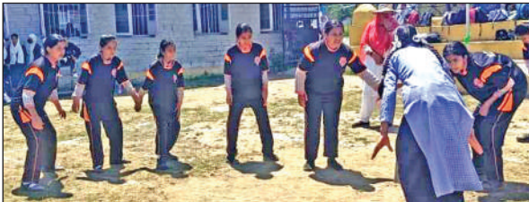
A girls kabaddi match in progress.

■ STATE TIMES NEWS DODA: The zonal level inter-school competition for Zone Bhaderwah commenced on Monday here at Government Girls Higher Secondary School (GGHS) Bhaderwah. The event is part of the annual calendar of activities approved by the Directorate of Youth Services and Sports, J&K UT, for the year 2024-25. The competition featured participation of students in the under-14 and under-17