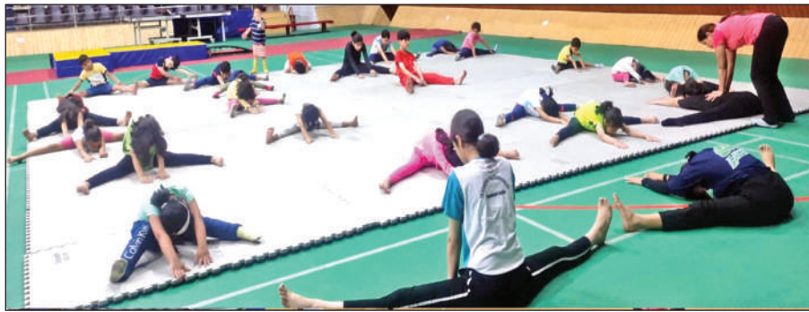
Expert practicing yoga during a camp.

advantage of the Sports Policy benefits, which include financial awards, admissions in professional colleges under sports quotas, job prospects under SO12, and much more" she added.