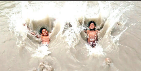
Boys jump into canal to beat the scorching heat in Jammu on Wednesday.

■ STATE TIMES NEWS JAMMU: Mercury continued its upward trend across the district, with Jammu city recording the season's highest temperature at 44.8 degrees Celsius, nearly 5.7 notches above the average, the Meteorological Department said on Wednesday. The region has been reeling under an extreme heatwave for the past week, with temperatures consistently rising above 40 degrees Celsius since May 16, the MeT department officials said. The day temperature in Jammu city was nearly 5.7 degrees Celsius above the season's average and 5 degrees Celsius higher than Wednesday's 39.3 degrees Celsius, they said.