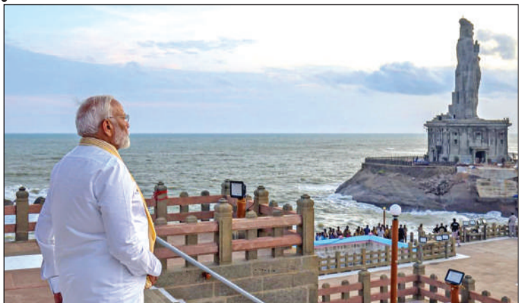
Prime Minister Narendra Modi at the Vivekananda Rock Memorial in Kanyakumari on Thursday.

the 'dhyana mandapam.' Before he embarked on the dhyana exercise, for a while, Modi stood on the stairs leading to the mandapam that offers breathtaking views of the sea that surrounds the memorial from all sides.