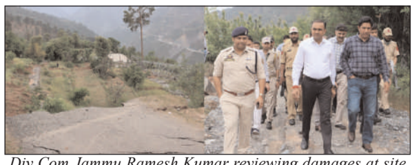
Div Com Jammu Ramesh Kumar reviewing damages at site of calamity during visit to Pernote Village.

Reviews relief & rehabilitation measures taken by District Admin