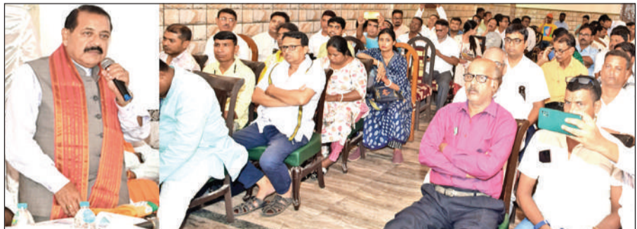
Union Minister Dr. Jitendra Singh addressing a BJP Election meeting at Barackpore Lok Sabha constituency, West Bengal on Friday.