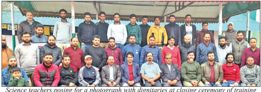
Science teachers posing for a photograph with dignitaries at closing ceremony of training workshop at AGS Wynne.