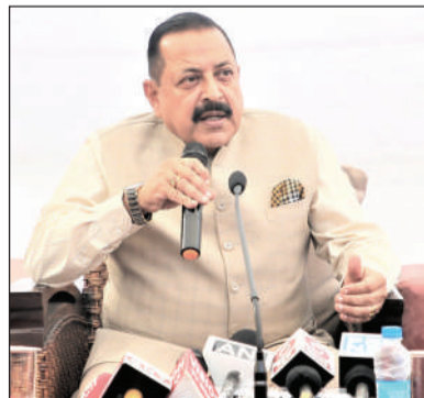
Union Minister Dr. Jitendra Singh in a media interaction during BJP election campaign.

Most of the successive governments before 2014, he said, were either short lived or they were led by non-uniform conglomerates which resulted in indecisiveness and lack of firm posturing, the consequences of which was that most of the countries in the world either looked down upon India as a fragile nation or were reluctant to engage with the then governments at the Centre because of the uncertainty of their stability.