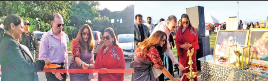
Dignitaries inaugurating Gulab- A Night Soiree at the iconic Hari Niwas Palace.