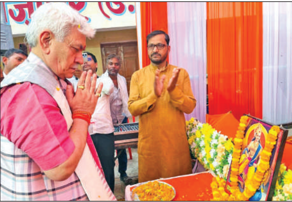
Lieutenant Governor Manoj Sinha paying tributes to Chandragupta Maurya at Ghazipur.

■ STATE TIMES NEWS GHAZIPUR: Describing Chandragupta Maurya as the symbol of India's pride and progress, Lieutenant Governor Manoj Sinha on Sunday said he had awakened national consciousness by building a united and prosperous India and set the stage for our country to occupy the position of Vishwa Guru. Addressing a seminar on "the legacy of Chandragupta Maurya's good governance in shaping the modern administrative framework" here, the Lt Governor, in his address, highlighted the remarkable contribution of Chandragupta Maurya, founder of the Maurya Empire, in promoting ideals of equity, inclusiveness, responsiveness, rule of law and citizen