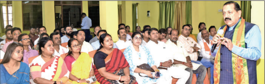
Union Minister Dr. Jitendra Singh addressing a BJP election meeting of Howrah Lok Sabha constituency on Sunday.