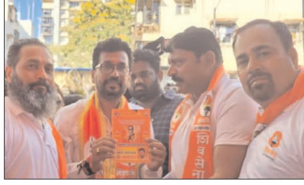
J&K Shiv Sena (UBT) team campaigning for party candidate.