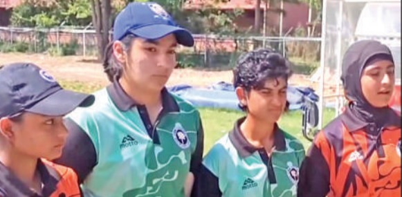
Women cricket players during a protest.