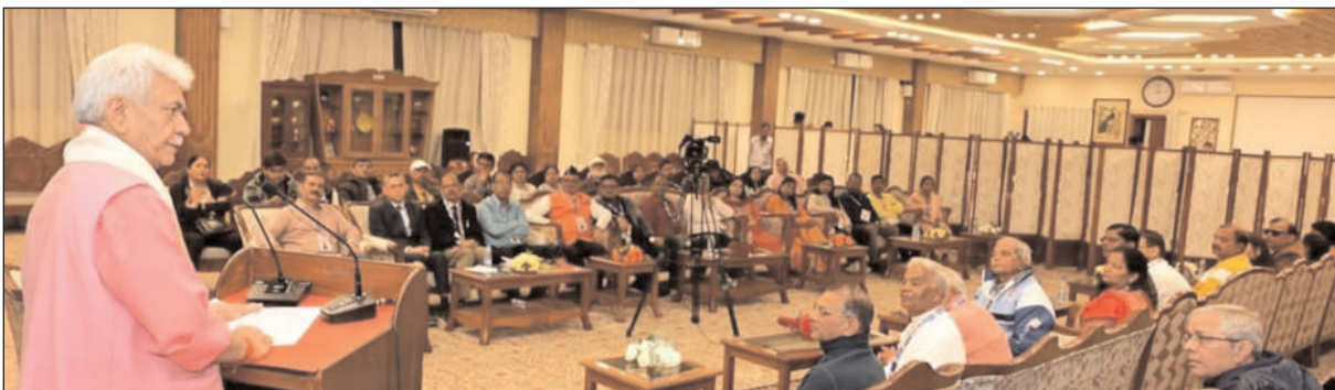
LG Manoj Sinha addressing Allahabad University Alumni Meet at Raj Bhawan, Srinagar.

STATE TIMES NEWS SRINAGAR: Lieutenant Governor Manoj Sinha addressed the Allahabad University Alumni Meet at Raj Bhawan on Tuesday. In his address, the Lt Governor lauded the accomplishment of Alumni who have made their mark in various fields in India and abroad. "Alumni are the brand ambassador of the institution. Given their links with alma-mater, they are in a unique position to