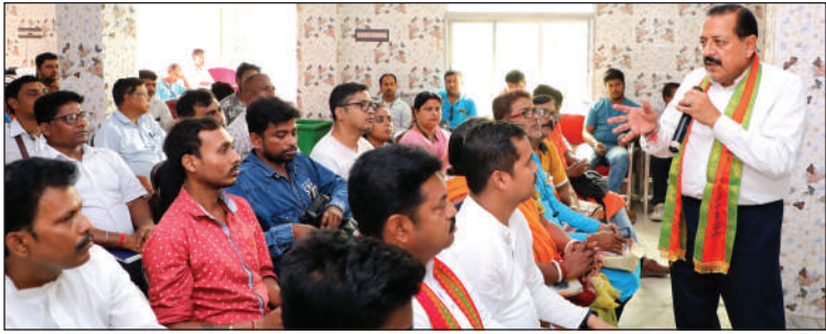
Union Minister Dr. Jitendra Singh addressing an election meeting in Uluberia Lok Sabha constituency on Wednesday.

In the last 10 years, said Dr. Jitendra, Prime Minister Narendra